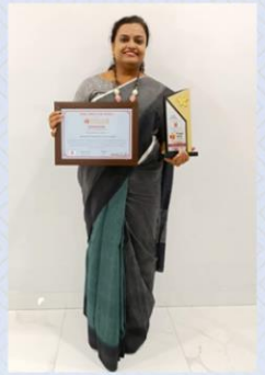
BDMI is honoured to receive the certificate of excellence from the Times of India at Times NIE Principal's Seminar 2024