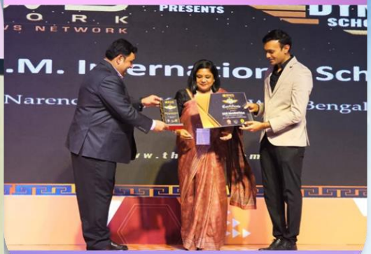
DYNAMIC SCHOOL AWARD