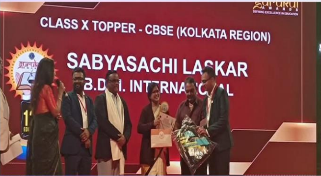
Lions Gurukul Award 2025 Celebrating Excellence at B.D.M. International